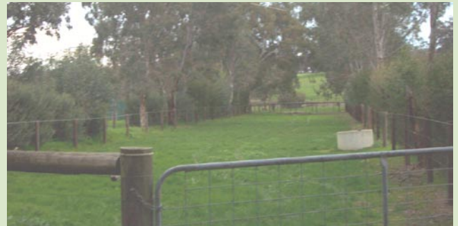
An example of shelterbelts formed each side of a drainage line. Wet weather roadway stormwater runoff makes its way through this natural drainage line to a dam. The drainage line is then usable for dry weather grazing by horses."

Shelterbelts also enhance the look of your horse property, improving aesthetic appearance and even potential resale value.